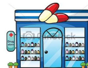
© Can Stock Photo - csp11905390